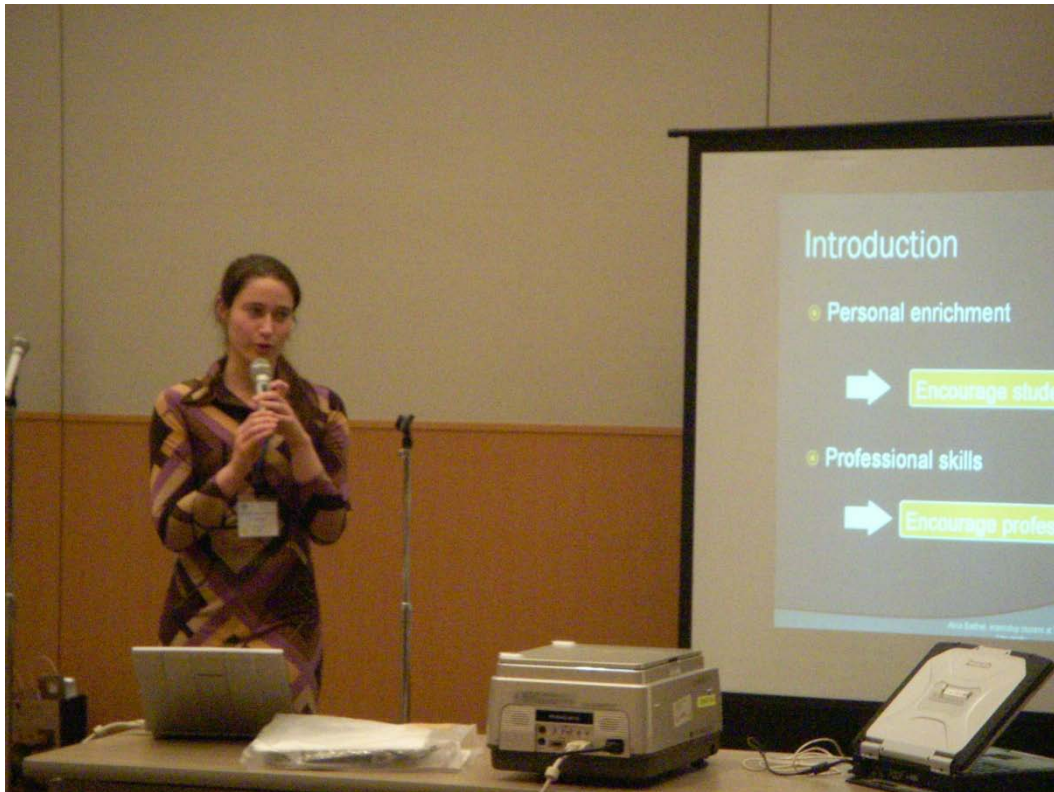
Presenting my abroad experience at ICFD2010 Friendship Night