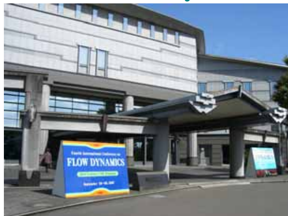
Venue: Sendai International Center

With the participants being 412 domestic and international researchers from 26 countries, the conference opened the new commitment of the 21st Century COE Program "International COE of Flow Dynamics" to the world, as well as introduced cutting edge research results on flow dynamics by the world's leading researchers.