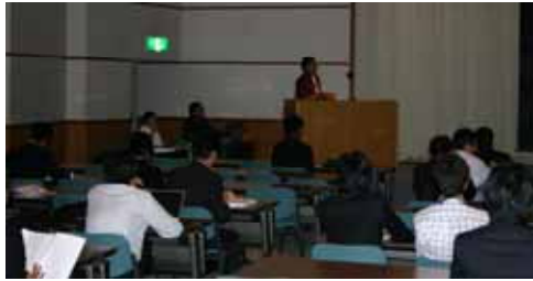
Short oral presentation

On the Third International Students/Young Birds Seminar on Multi-scale Flow Dynamics