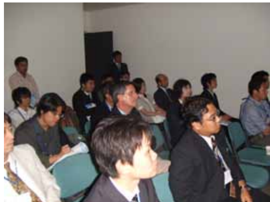
Lecture at OS3