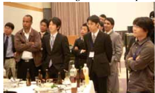
Short presentation at a beer party