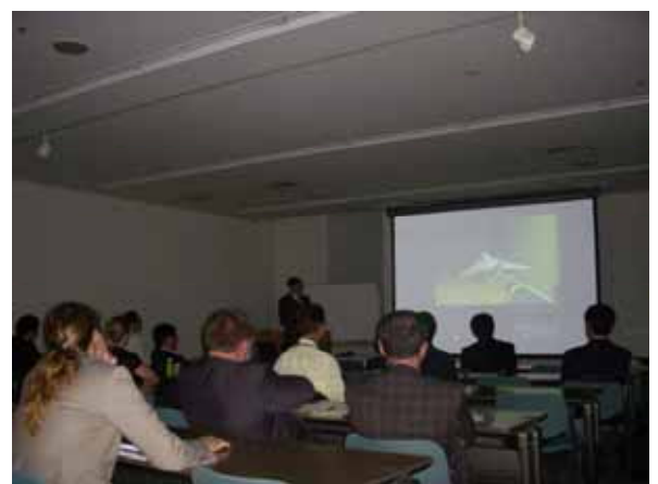
A scene at the lecture