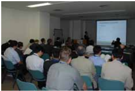
OS4: Question-and-answer session

[OS4] Nano-mega Scale Flow Dynamics in Complex Systems September 26 - 28, 'ROOM7'