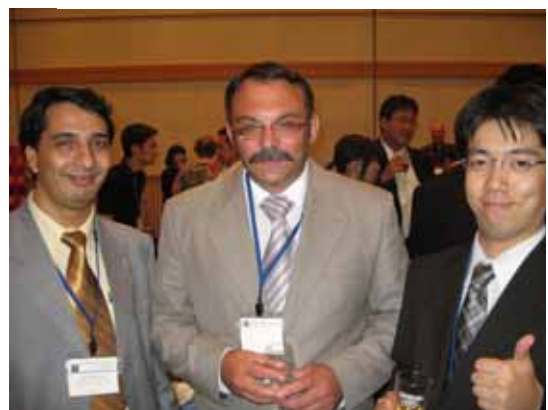
A scene from the fellowship banquet