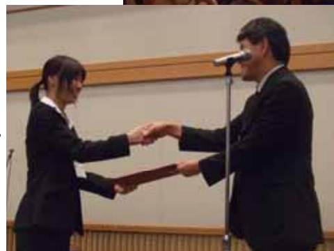
Student receiving an award at the banquet hall