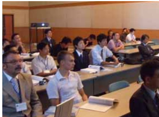
Lecture at OS1